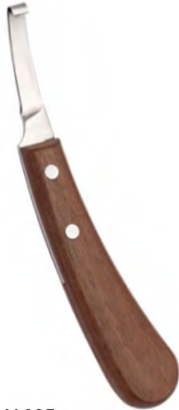
V-835 HOOF KNIVES