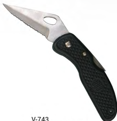
V-743 HORSEMEN KNIVES