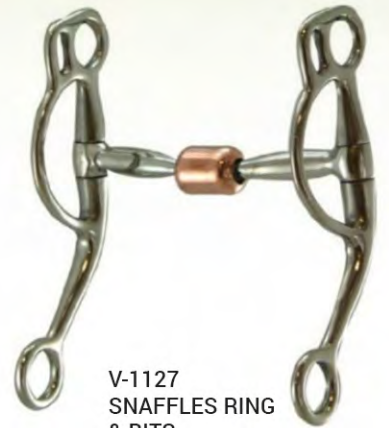
V-1127 SNAFFLES RING & BITS