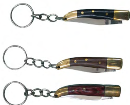
V-748 HORSEMEN KNIVES