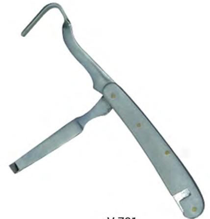
V-731 HOOF & CLAW INSTRUMENTS