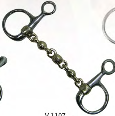
V-1107 SNAFFLES RING & BITS