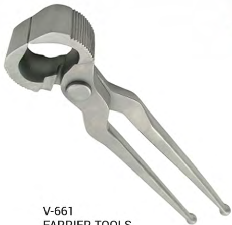
V-661 FARRIER TOOLS