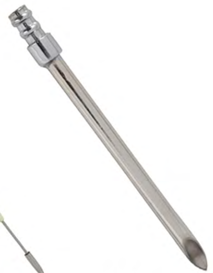
V-842 TEAT INSTRUMENT