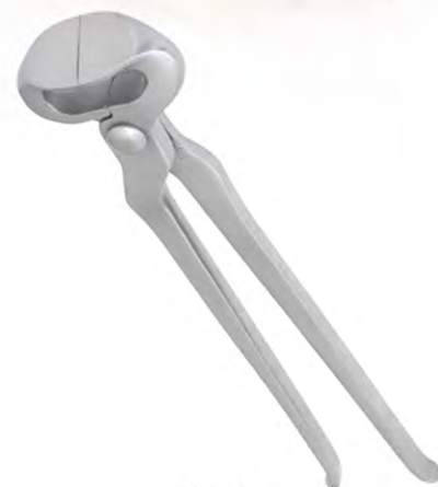
V-663 FARRIER TOOLS