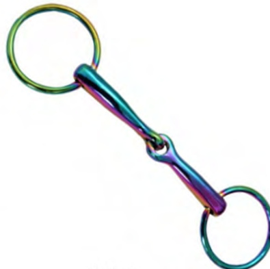
V-1123 SNAFFLES RING & BITS