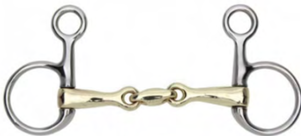
V-1147 SNAFFLES RING & BITS