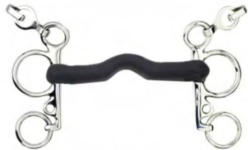
V-1136 SNAFFLES RING & BITS