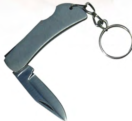
V-744 HORSEMEN KNIVES