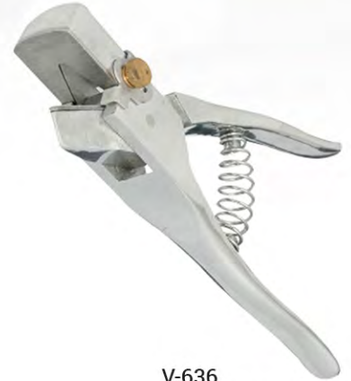
V-636 EAR MARKING & TAGGING