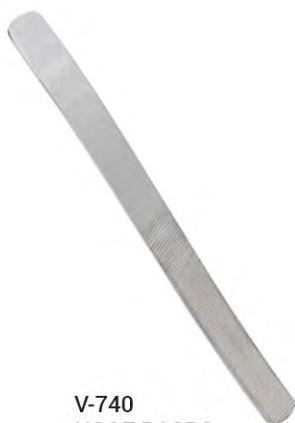
V-740 HOOF RASPS