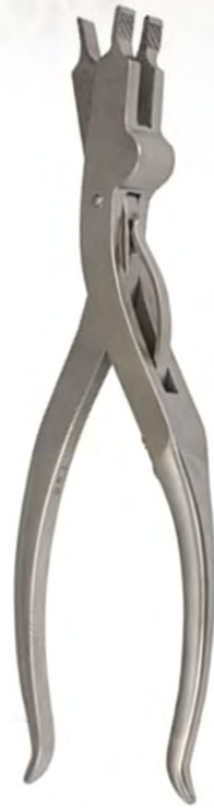
V-759 PLASTER INSTRUMENTS