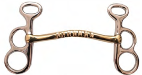
V-1121 SNAFFLES RING & BITS