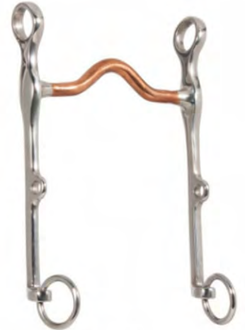
V-1130 SNAFFLES RING & BITS