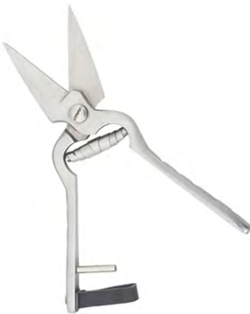
V-719 HOOF & CLAW INSTRUMENTS