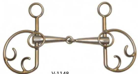
V-1148 SNAFFLES RING & BITS