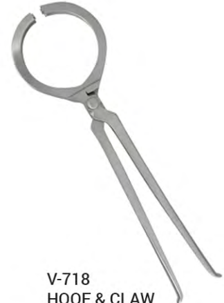
V-718 HOOF & CLAW INSTRUMENTS