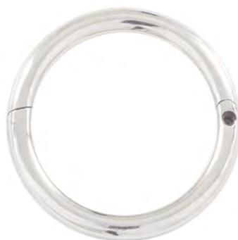
V-811 RING APPLICATORS