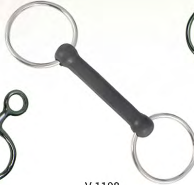
V-1108 SNAFFLES RING & BITS