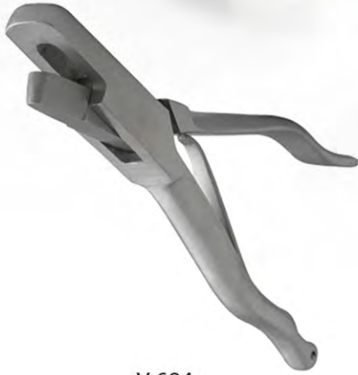
V-634 EAR MARKING & TAGGING