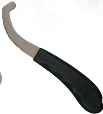
V-694 GROOMING EQUIPMENTS