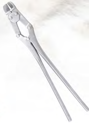
V-652 EQUINE DENTAL INSTRUMENTS