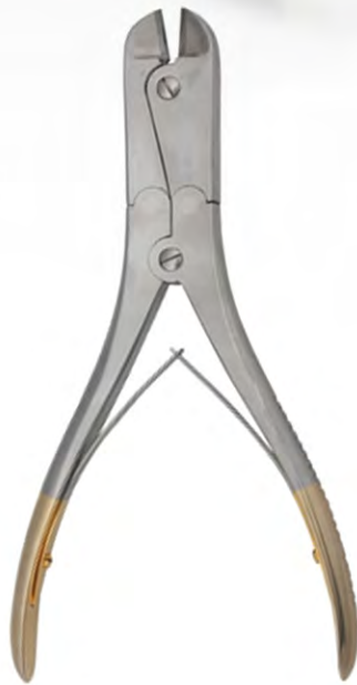
V-539 BONE SURGERY