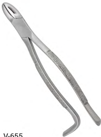
V-655 EQUINE DENTAL INSTRUMENTS