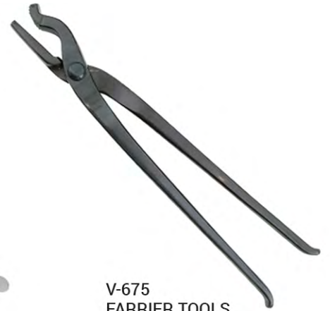
V-675 FARRIER TOOLS