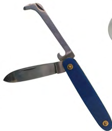
V-720 HOOF & CLAW INSTRUMENTS