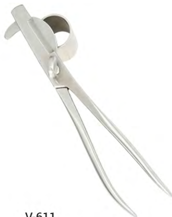
V-611 CASTRATION INSTRUMENTS