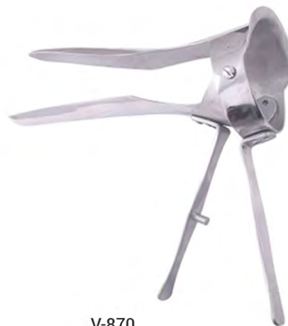
V-870 VAGINAL INSTRUMENTS