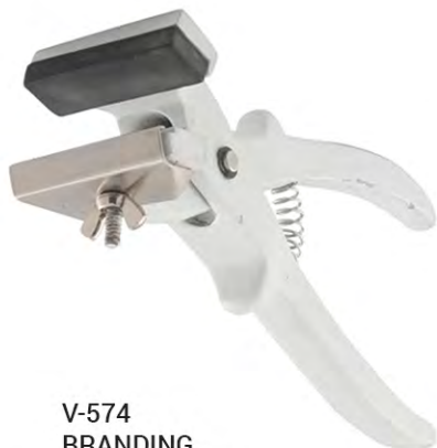
V-574 BRANDING INSTRUMENTS