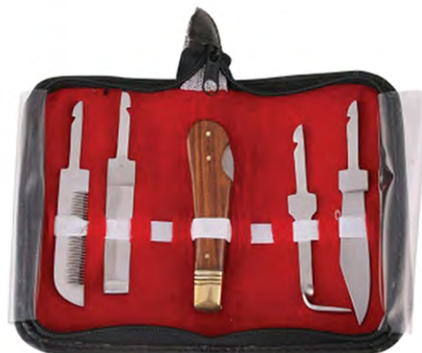
V-733 HOOF & CLAW INSTRUMENTS