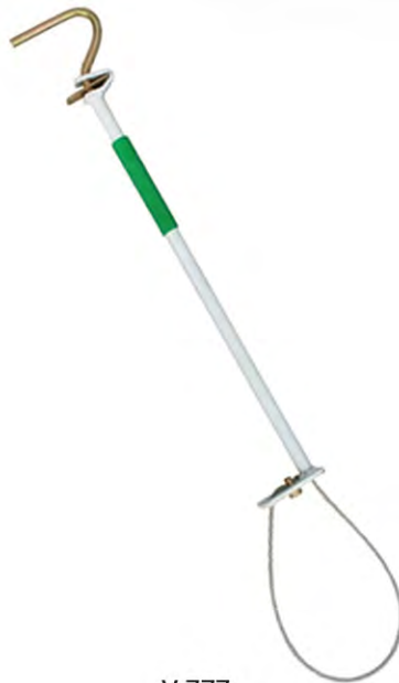
V-777 RESTRAINING INSTRUMENTS