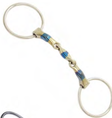
V-1138 SNAFFLES RING & BITS