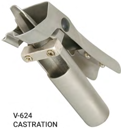
V-624 CASTRATION INSTRUMENTS