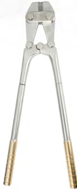
V-542 BONE SURGERY