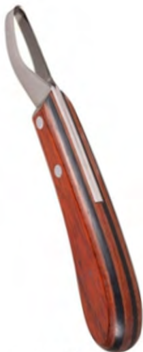
V-831 HOOF KNIVES