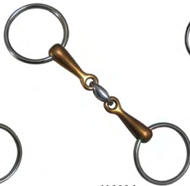
V-1114 SNAFFLES RING & BITS