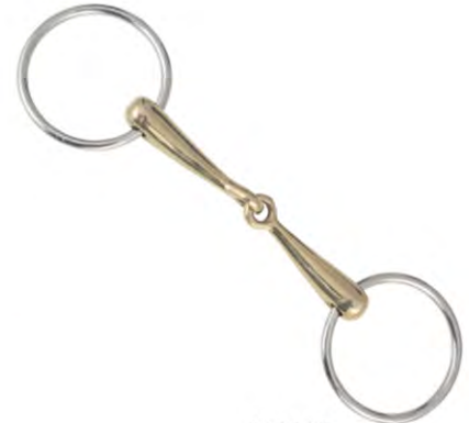
V-1112 SNAFFLES RING & BITS