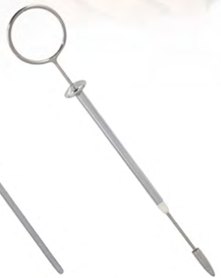
V-838 TEAT INSTRUMENT