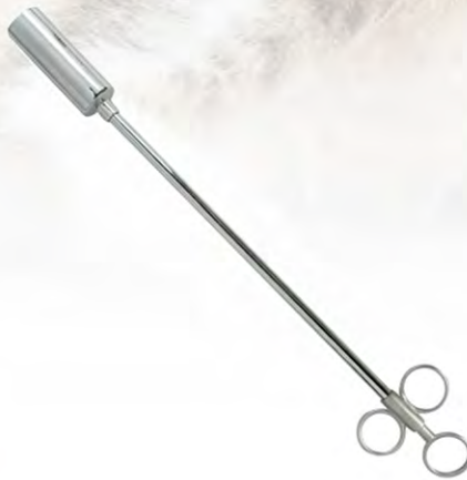
V-502 BALLING GUNS