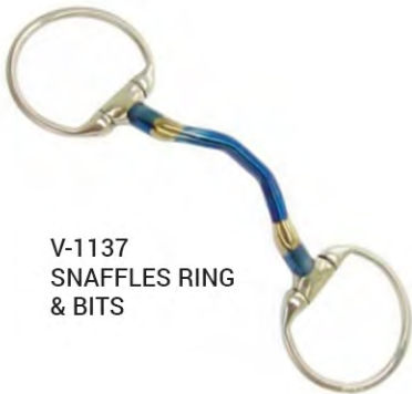
V-1137 SNAFFLES RING & BITS