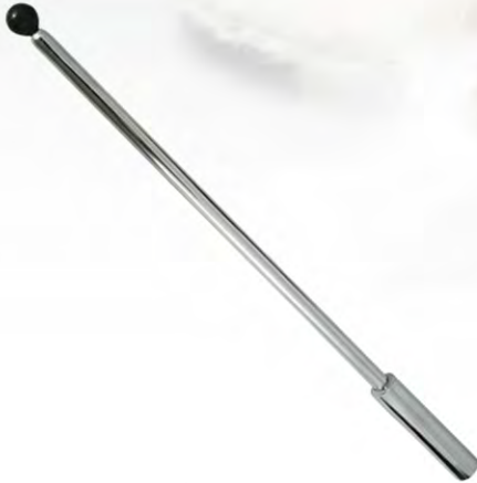
V-501 BALLING GUNS