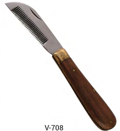
V-708 GROOMING EQUIPMENTS