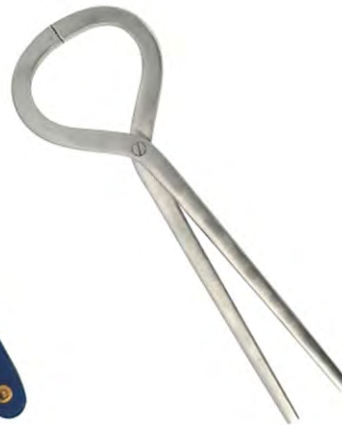
V-721 HOOF & CLAW INSTRUMENTS