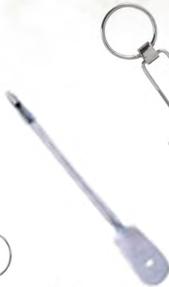
V-837 TEAT INSTRUMENT