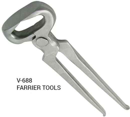
V-688 FARRIER TOOLS