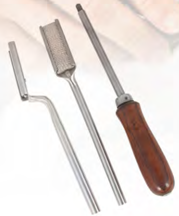
V-654 EQUINE DENTAL INSTRUMENTS