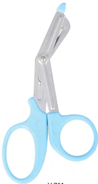
V-761 PLASTER INSTRUMENTS