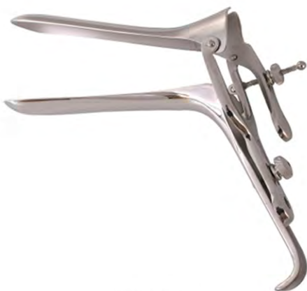
V-869 VAGINAL INSTRUMENTS