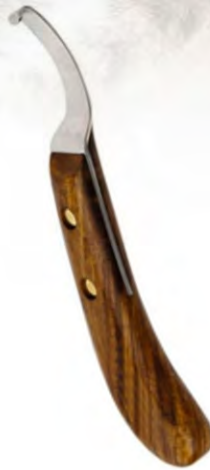
V-826 HOOF KNIVES