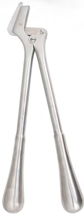
V-758 PLASTER INSTRUMENTS