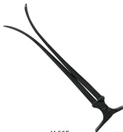
V-665 FARRIER TOOLS