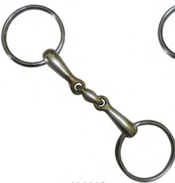
V-1113 SNAFFLES RING & BITS