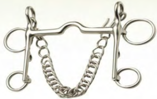
V-1134 SNAFFLES RING & BITS