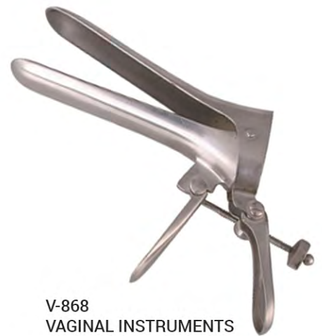
V-868 VAGINAL INSTRUMENTS