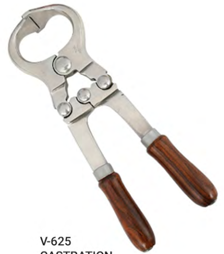
V-625 CASTRATION INSTRUMENTS