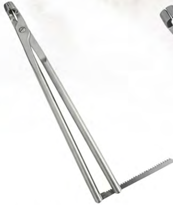
V-642 EQUINE DENTAL INSTRUMENTS