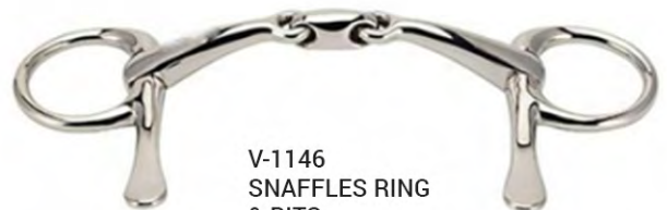
V-1146 SNAFFLES RING & BITS