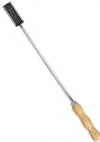
V-646 EQUINE DENTAL INSTRUMENTS