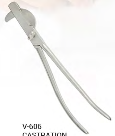
V-606 CASTRATION INSTRUMENTS