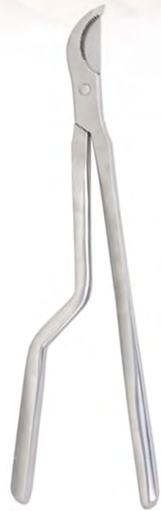
V-760 PLASTER INSTRUMENTS