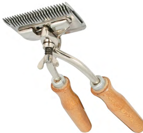
V-710 GROOMING EQUIPMENTS