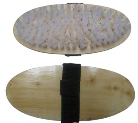
V-711 GROOMING EQUIPMENTS