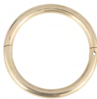
V-812 RING APPLICATORS