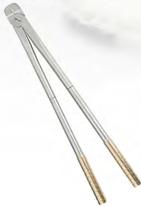
V-651 EQUINE DENTAL INSTRUMENTS