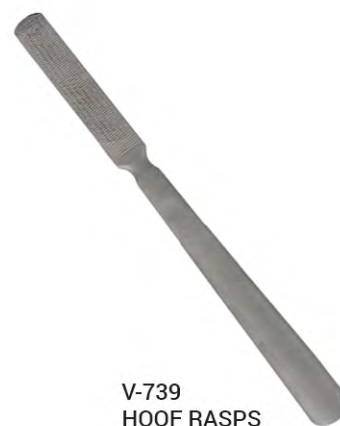
V-739 HOOF RASPS