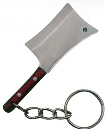
V-742 HORSEMEN KNIVES