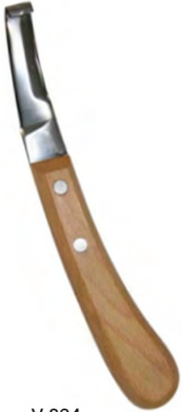
V-834 HOOF KNIVES