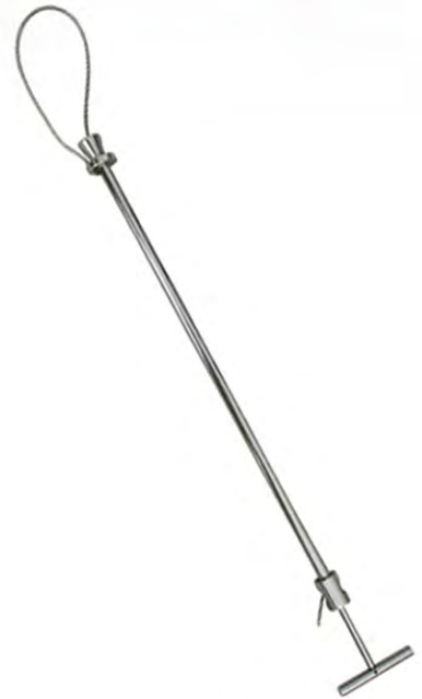
V-778 RESTRAINING INSTRUMENTS