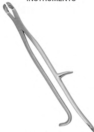
V-649 EQUINE DENTAL INSTRUMENTS