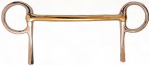
V-1117 SNAFFLES RING & BITS