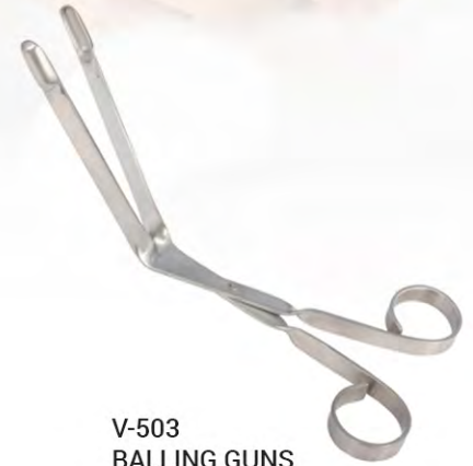
V-503 BALLING GUNS