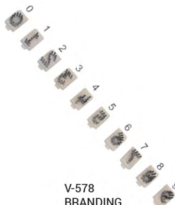
V-578 BRANDING INSTRUMENTS