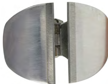
V-544 BONE SURGERY