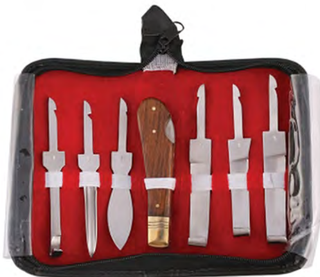
V-732 HOOF & CLAW INSTRUMENTS