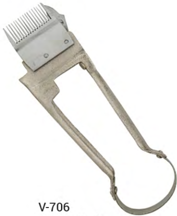
V-706 GROOMING EQUIPMENTS