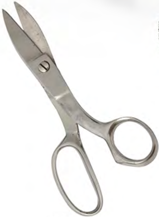
V-693 GROOMING EQUIPMENTS