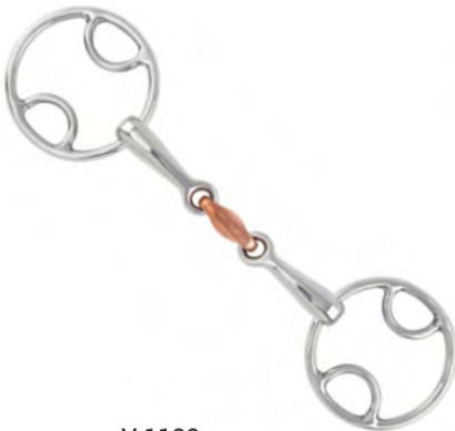
V-1122 SNAFFLES RING & BITS