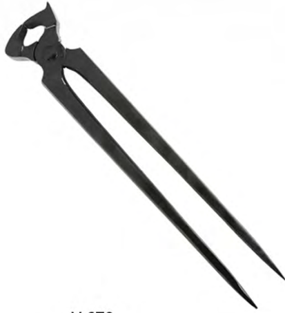
V-670 FARRIER TOOLS