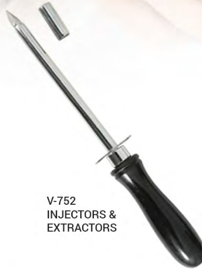
V-752 INJECTORS & EXTRACTORS