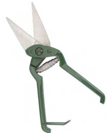
V-722 HOOF & CLAW INSTRUMENTS