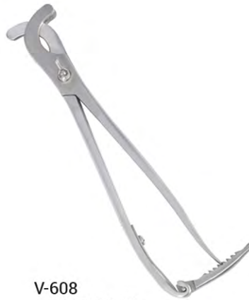
V-608 CASTRATION INSTRUMENTS