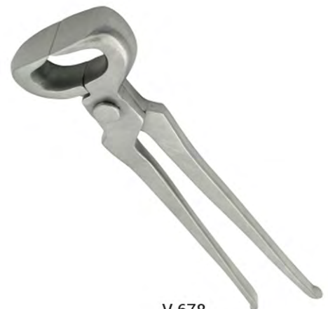
V-678 FARRIER TOOLS