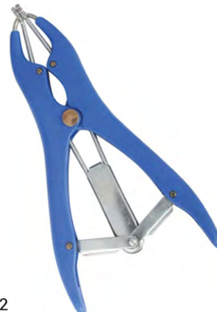
V-612 CASTRATION INSTRUMENTS