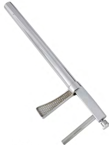
V-505 BALLING GUNS