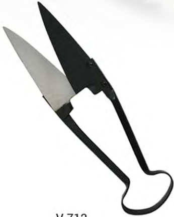
V-712 HOOF & CLAW INSTRUMENTS