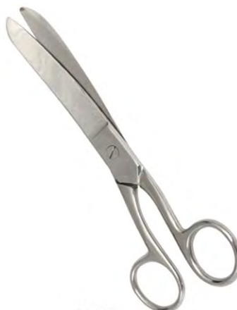
V-701 GROOMING EQUIPMENTS