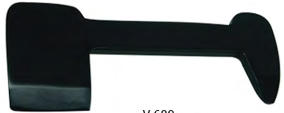
V-689 FARRIER TOOLS