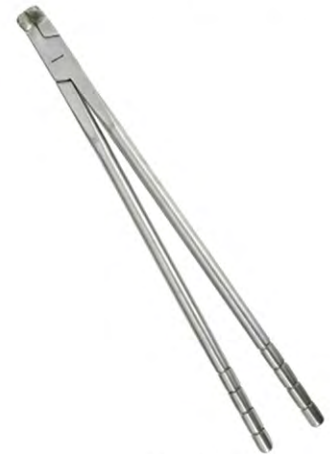
V-647 EQUINE DENTAL INSTRUMENTS