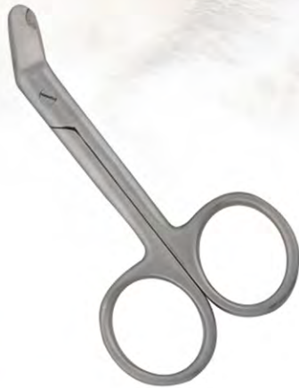
V-725 HOOF & CLAW INSTRUMENTS