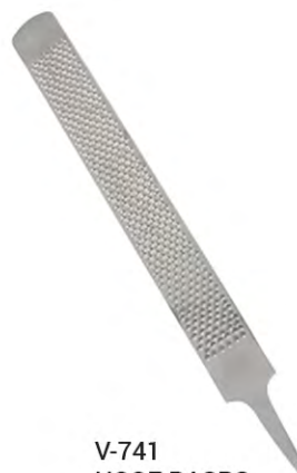
V-741 HOOF RASPS