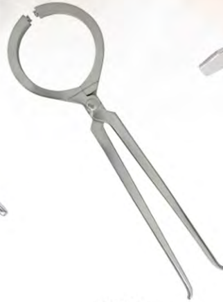
V-714 HOOF & CLAW INSTRUMENTS