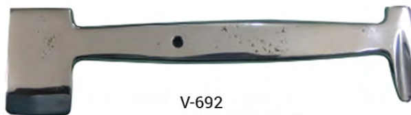
V-692 FARRIER TOOLS