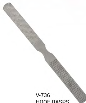
V-736 HOOF RASPS