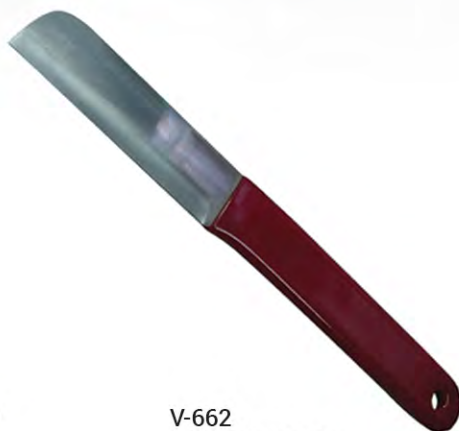
V-662 FARRIER TOOLS