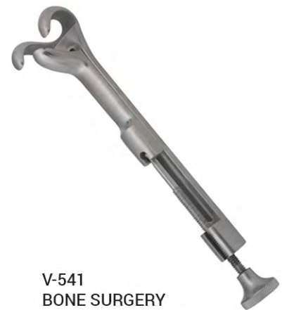
V-541 BONE SURGERY