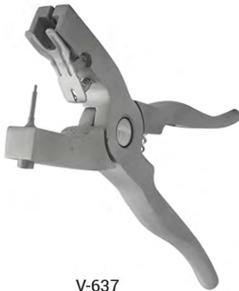
V-637 EAR MARKING & TAGGING