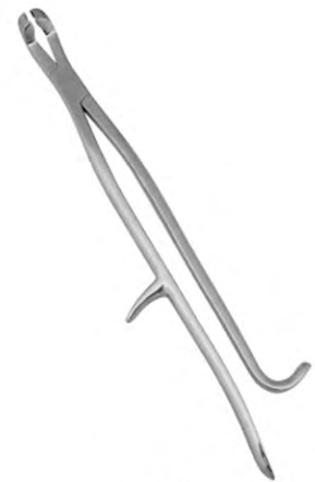
V-657 EQUINE DENTAL INSTRUMENTS