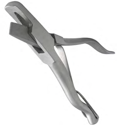
V-638 EAR MARKING & TAGGING