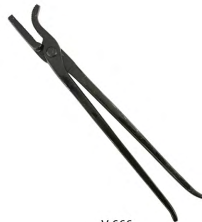
V-666 FARRIER TOOLS