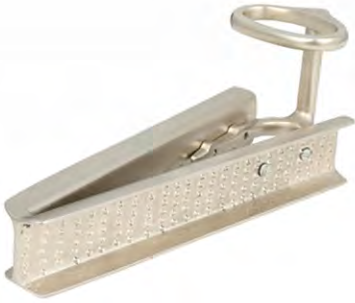
V-641 EQUINE DENTAL INSTRUMENTS