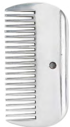
V-702 GROOMING EQUIPMENTS