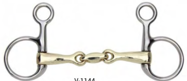
V-1144 SNAFFLES RING & BITS