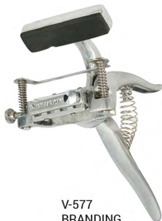
V-577 BRANDING INSTRUMENTS