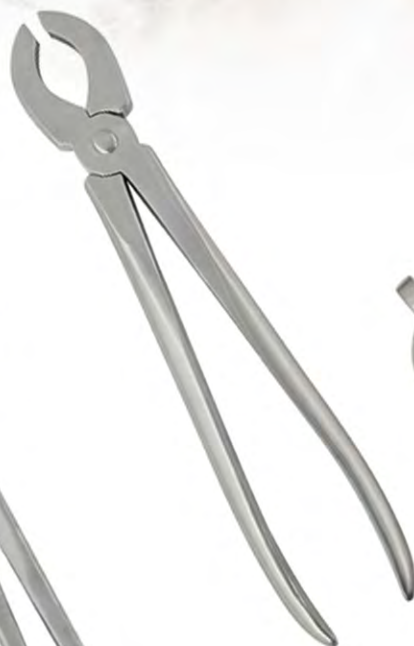
V-808 RING APPLICATORS