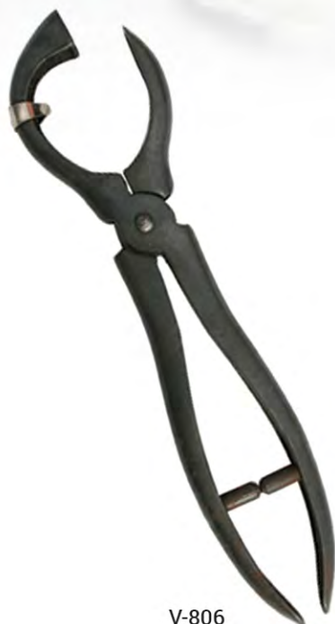
V-806 RING APPLICATORS