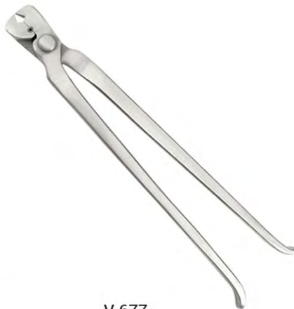
V-677 FARRIER TOOLS