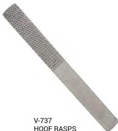
V-737 HOOF RASPS