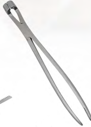
V-643 EQUINE DENTAL INSTRUMENTS