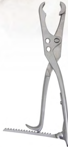
V-545 BONE SURGERY