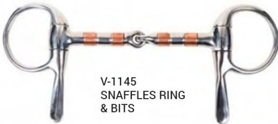
V-1145 SNAFFLES RING & BITS