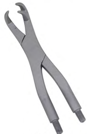
V-660 EQUINE DENTAL INSTRUMENTS