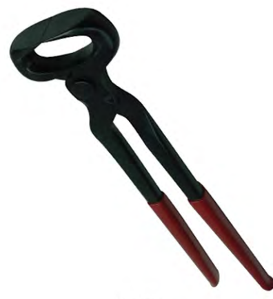
V-669 FARRIER TOOLS