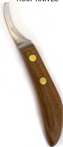
V-829 HOOF KNIVES