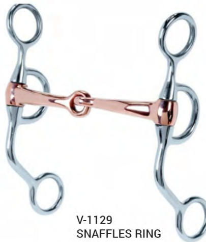
V-1129 SNAFFLES RING & BITS