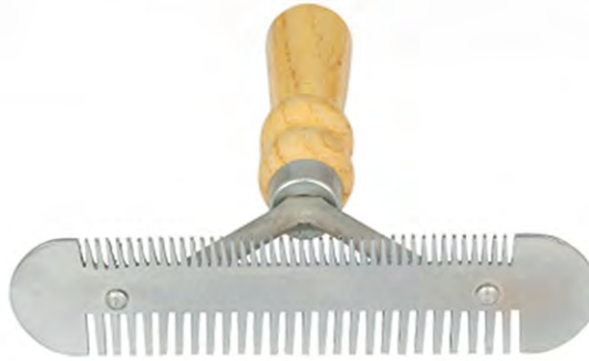
V-704 GROOMING EQUIPMENTS