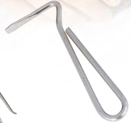
V-715 HOOF & CLAW INSTRUMENTS