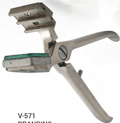
V-571 BRANDING INSTRUMENTS