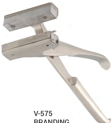
V-575 BRANDING INSTRUMENTS