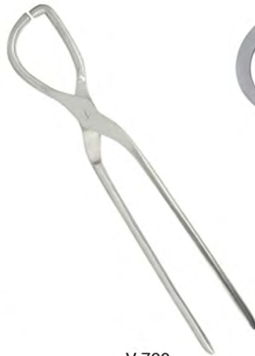
V-729 HOOF & CLAW INSTRUMENTS