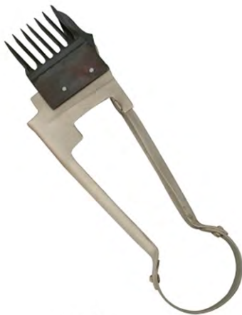
V-709 GROOMING EQUIPMENTS