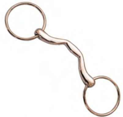
V-1124 SNAFFLES RING & BITS