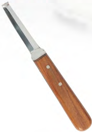
V-724 HOOF & CLAW INSTRUMENTS