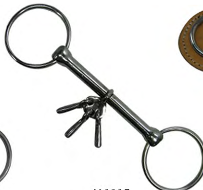
V-1115 SNAFFLES RING & BITS