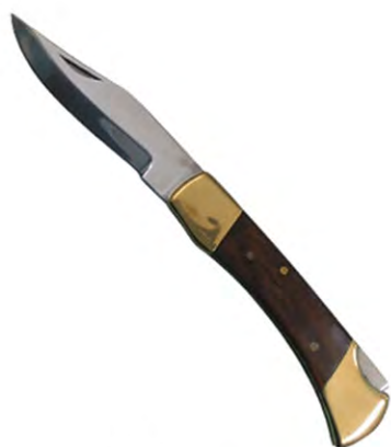
V-745 HORSEMEN KNIVES