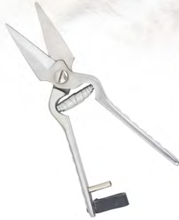
V-713 HOOF & CLAW INSTRUMENTS