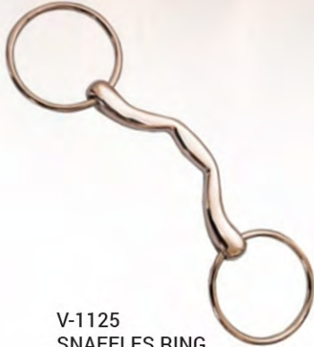
V-1125 SNAFFLES RING & BITS