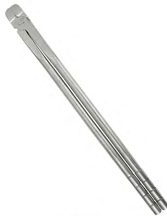
V-656 EQUINE DENTAL INSTRUMENTS