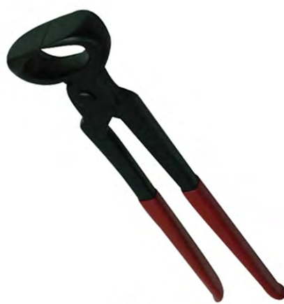
V-668 FARRIER TOOLS