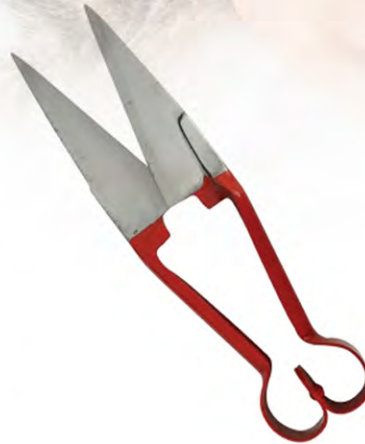
V-726 HOOF & CLAW INSTRUMENTS