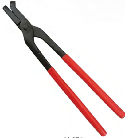
V-671 FARRIER TOOLS