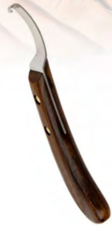
V-827 HOOF KNIVES