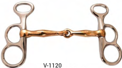
V-1120 SNAFFLES RING & BITS