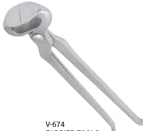
V-674 FARRIER TOOLS