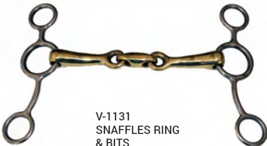
V-1131 SNAFFLES RING & BITS