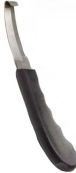
V-836 HOOF KNIVES