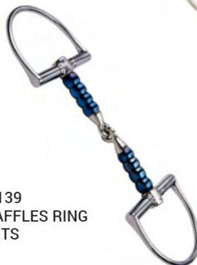
V-1139 SNAFFLES RING & BITS