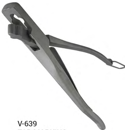
V-639 EAR MARKING & TAGGING