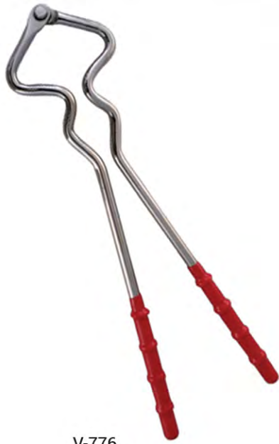
V-776 RESTRAINING INSTRUMENTS