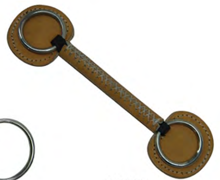
V-1116 SNAFFLES RING & BITS