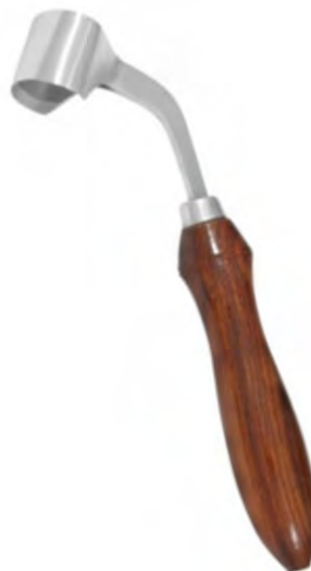
V-832 HOOF KNIVES