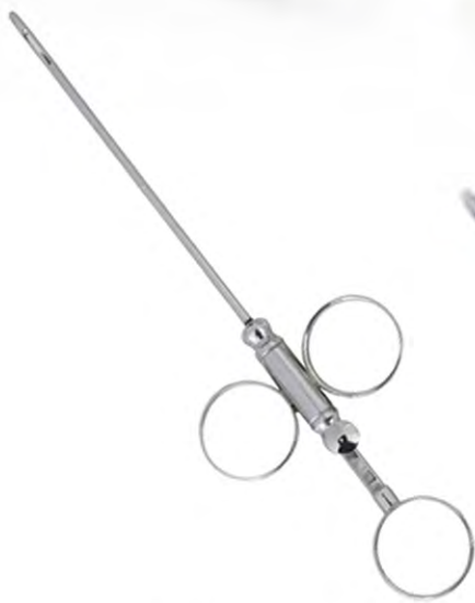
V-836 TEAT INSTRUMENT