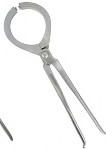
V-730 HOOF & CLAW INSTRUMENTS