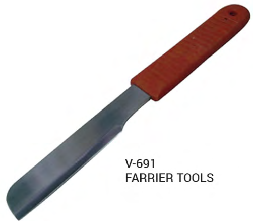
V-691 FARRIER TOOLS