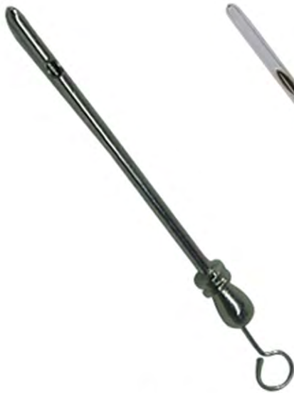
V-840 TEAT INSTRUMENT