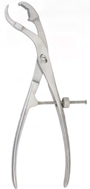
V-543 BONE SURGERY