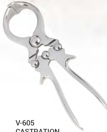
V-605 CASTRATION INSTRUMENTS