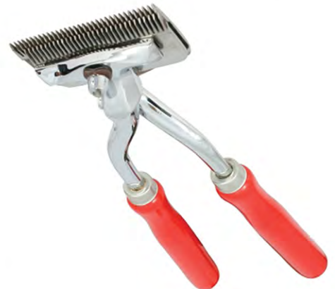
V-699 GROOMING EQUIPMENTS