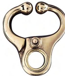
V-781 RESTRAINING INSTRUMENTS