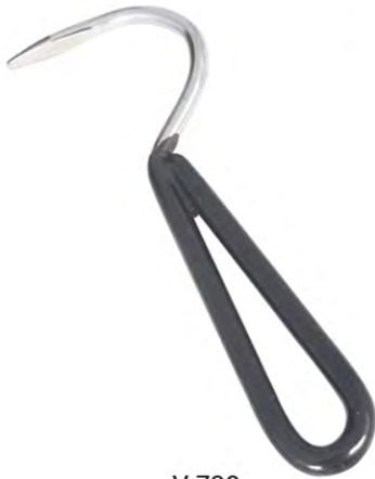
V-728 HOOF & CLAW INSTRUMENTS