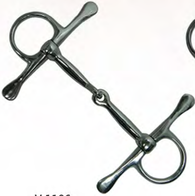
V-1106 SNAFFLES RING & BITS