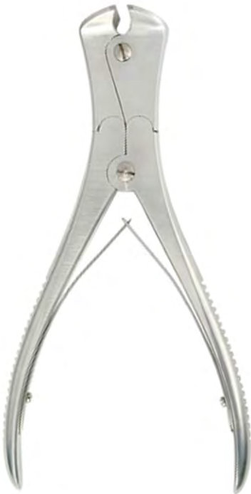
V-536 BONE SURGERY