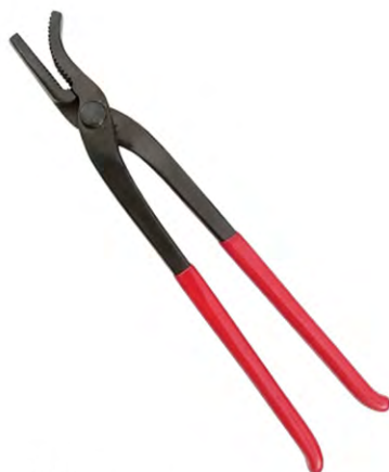
V-667 FARRIER TOOLS