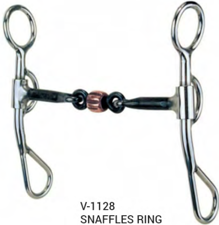
V-1128 SNAFFLES RING & BITS