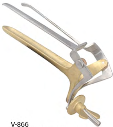
V-866 VAGINAL INSTRUMENTS