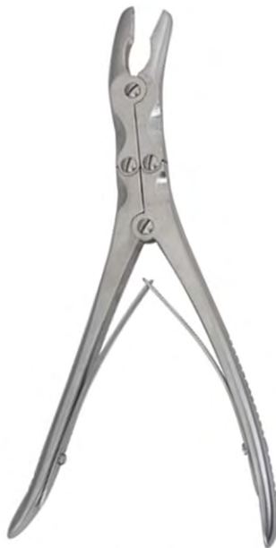
V-540 BONE SURGERY