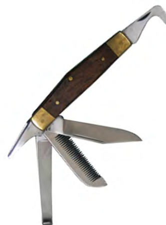
V-747 HORSEMEN KNIVES