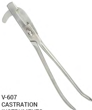
V-607 CASTRATION INSTRUMENTS