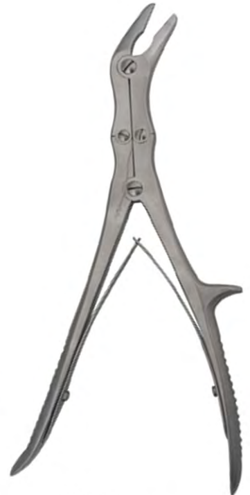
V-538 BONE SURGERY