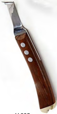
V-825 HOOF KNIVES