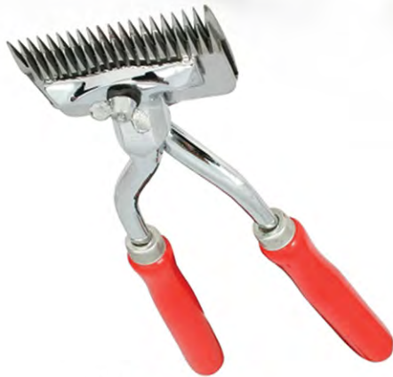
V-703 GROOMING EQUIPMENTS