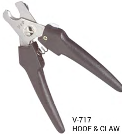
V-717 HOOF & CLAW INSTRUMENTS