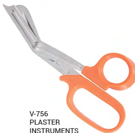
V-756 PLASTER INSTRUMENTS