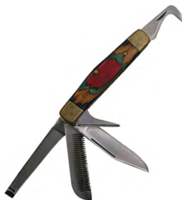
V-746 HORSEMEN KNIVES