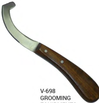
V-698 GROOMING EQUIPMENTS