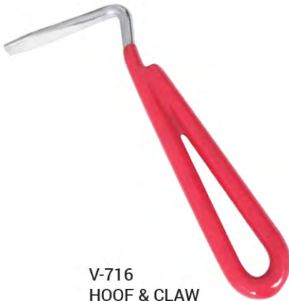
V-716 HOOF & CLAW INSTRUMENTS