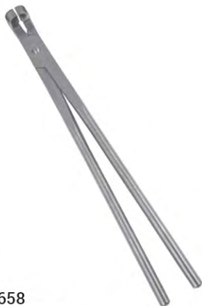
V-658 EQUINE DENTAL INSTRUMENTS