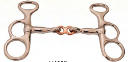
V-1119 SNAFFLES RING & BITS