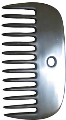
V-697 GROOMING EQUIPMENTS