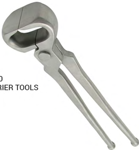
V-690 FARRIER TOOLS