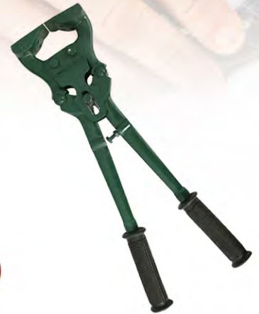
V-727 HOOF & CLAW INSTRUMENTS