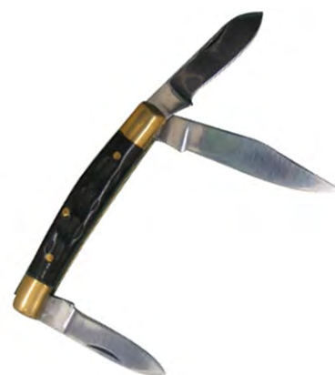
V-750 HORSEMEN KNIVES