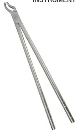
V-650 EQUINE DENTAL INSTRUMENTS