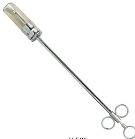
V-506 BALLING GUNS