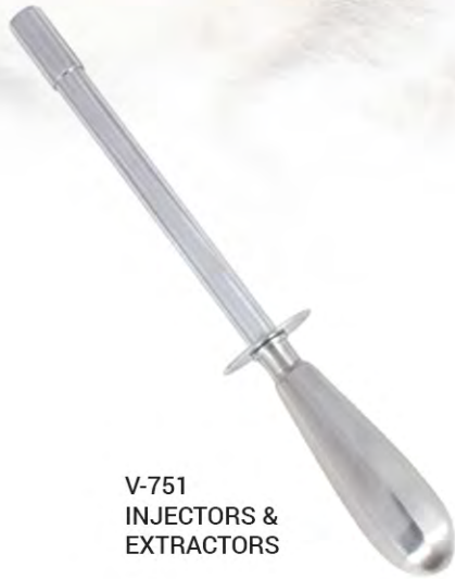
V-751 INJECTORS & EXTRACTORS