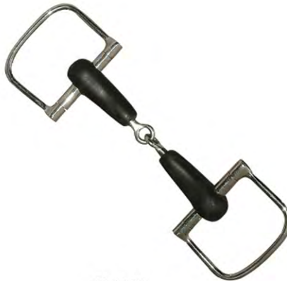
V-1111 SNAFFLES RING & BITS