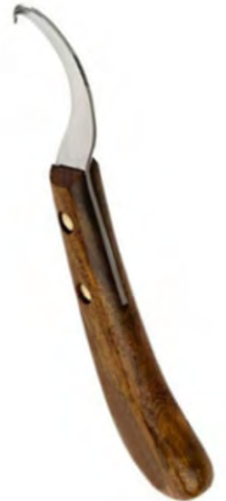
V-837 HOOF KNIVES