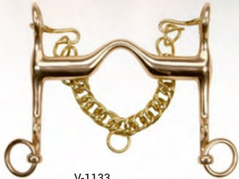
V-1133 SNAFFLES RING & BITS