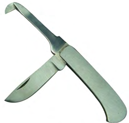
V-627 CASTRATION INSTRUMENTS