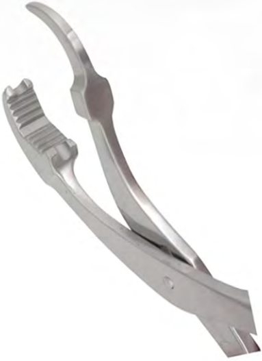
V-532 BONE SURGERY