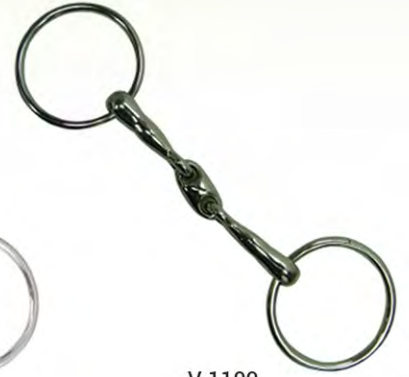
V-1109 SNAFFLES RING & BITS