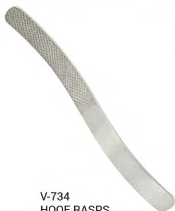
V-734 HOOF RASPS