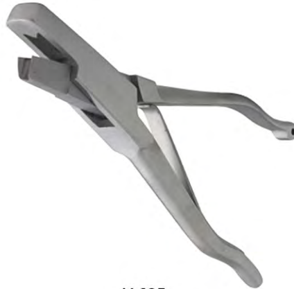
V-635 EAR MARKING & TAGGING