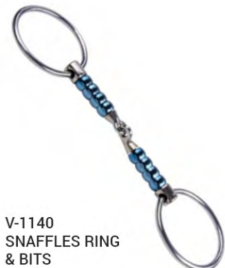
V-1140 SNAFFLES RING & BITS