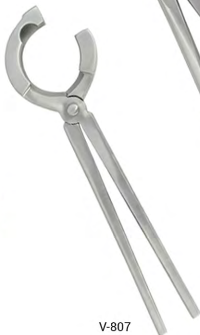
V-807 RING APPLICATORS