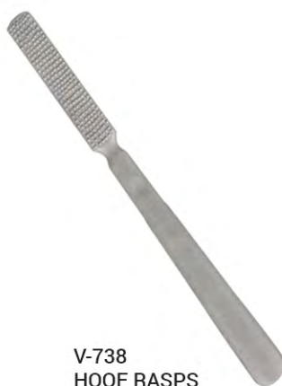
V-738 HOOF RASPS