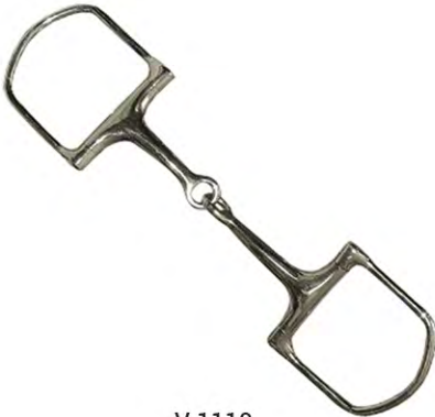
V-1110 SNAFFLES RING & BITS