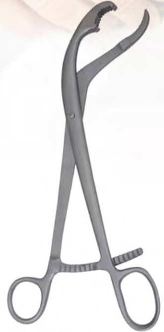
V-534 BONE SURGERY