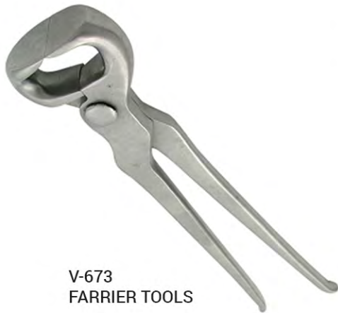
V-673 FARRIER TOOLS