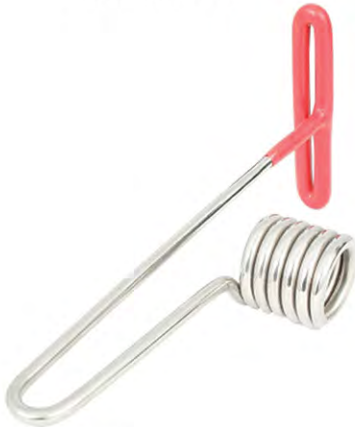
V-648 EQUINE DENTAL INSTRUMENTS