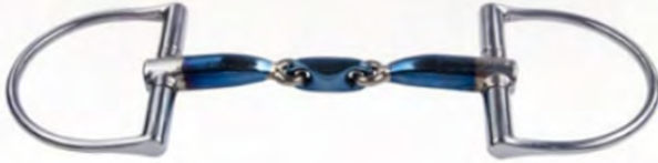
V-1141 SNAFFLES RING & BITS