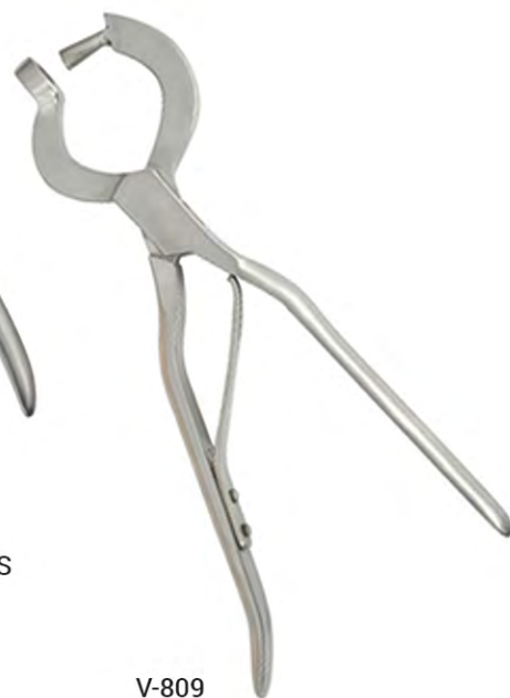
V-809 RING APPLICATORS