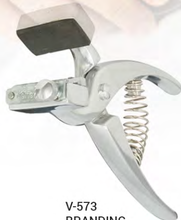
V-573 BRANDING INSTRUMENTS