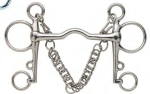
V-1132 SNAFFLES RING & BITS