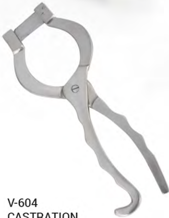
V-604 CASTRATION INSTRUMENTS