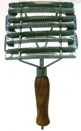
V-705 GROOMING EQUIPMENTS