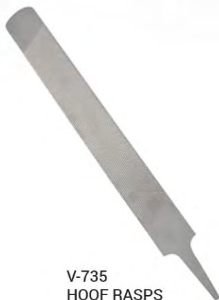
V-735 HOOF RASPS