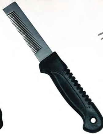
V-695 GROOMING EQUIPMENTS