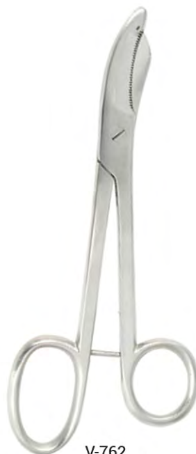
V-762 PLASTER INSTRUMENTS