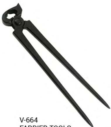
V-664 FARRIER TOOLS