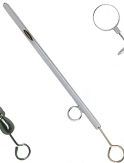
V-840 TEAT INSTRUMENT