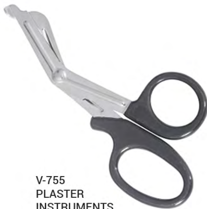
V-755 PLASTER INSTRUMENTS