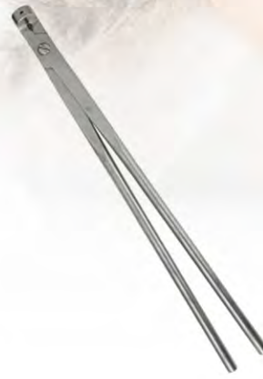
V-653 EQUINE DENTAL INSTRUMENTS