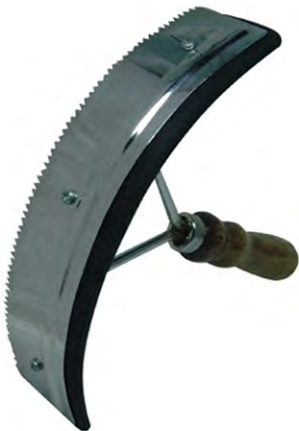
V-700 EQUINE DENTAL INSTRUMENTS