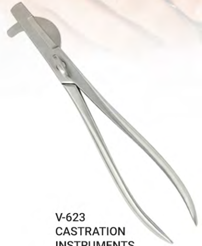
V-623 CASTRATION INSTRUMENTS