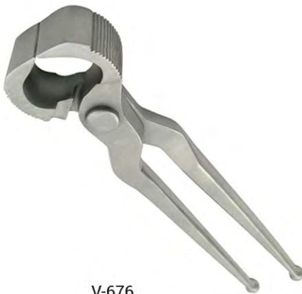
V-676 FARRIER TOOLS