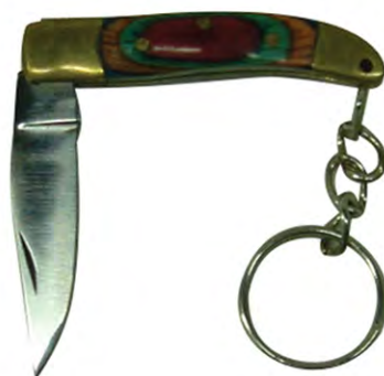
V-749 HORSEMEN KNIVES