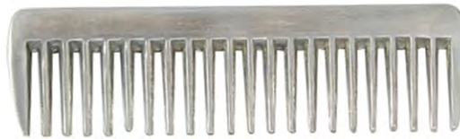
V-707 GROOMING EQUIPMENTS