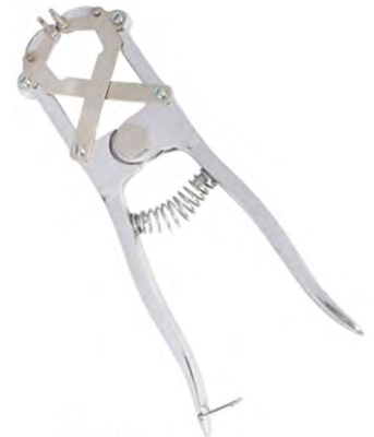
V-609 CASTRATION INSTRUMENTS