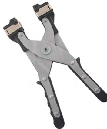
V-640 EAR MARKING & TAGGING