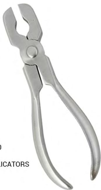
V-810 RING APPLICATORS