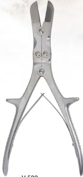
V-533 BONE SURGERY