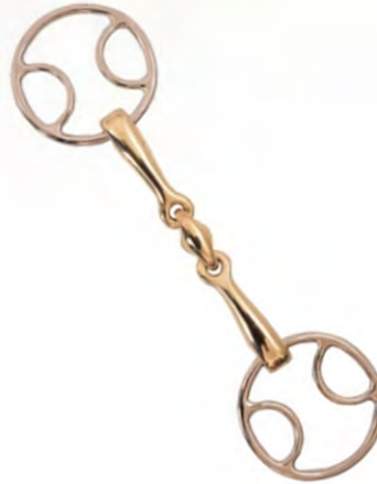
V-1126 SNAFFLES RING & BITS