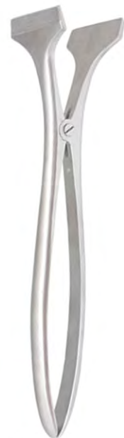
V-763 PLASTER INSTRUMENTS