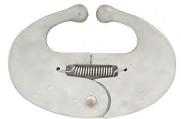
V-782 RESTRAINING INSTRUMENTS