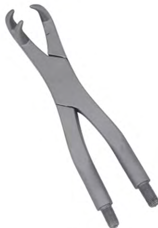
V-659 EQUINE DENTAL INSTRUMENTS