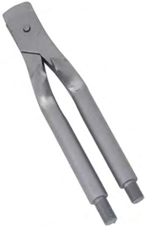
V-645 EQUINE DENTAL INSTRUMENTS