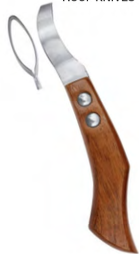
V-830 HOOF KNIVES