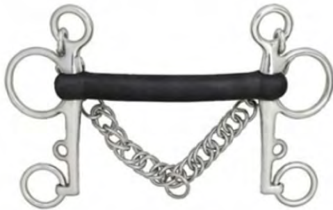
V-1135 SNAFFLES RING & BITS