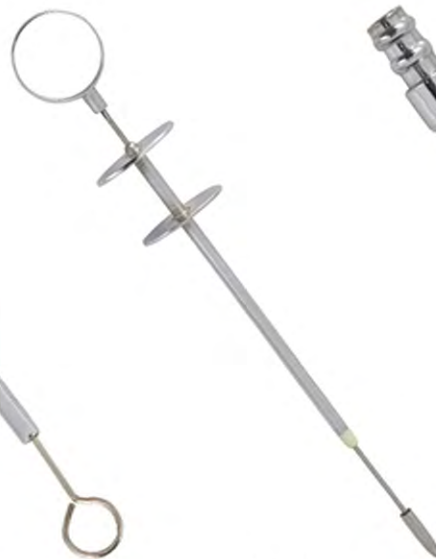
V-841 TEAT INSTRUMENT