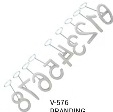
V-576 BRANDING INSTRUMENTS