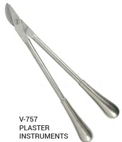
V-757 PLASTER INSTRUMENTS