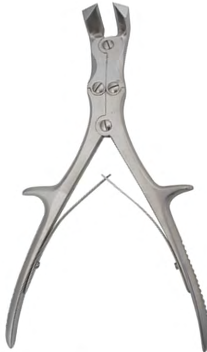
V-537 BONE SURGERY