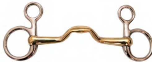
V-1118 SNAFFLES RING & BITS