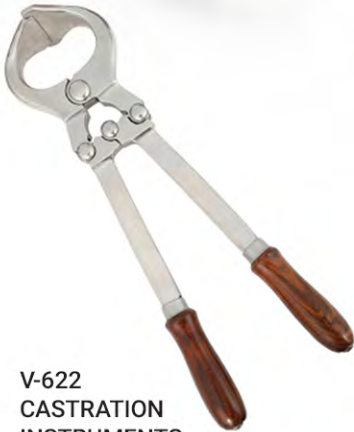
V-622 CASTRATION INSTRUMENTS