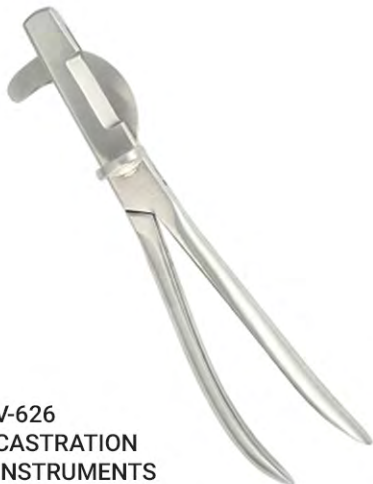
V-626 CASTRATION INSTRUMENTS