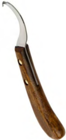
V-828 HOOF KNIVES