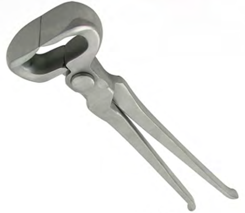
V-672 FARRIER TOOLS