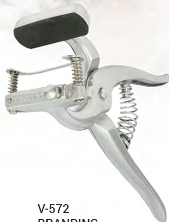
V-572 BRANDING INSTRUMENTS