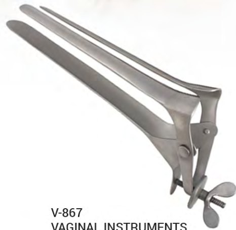
V-867 VAGINAL INSTRUMENTS