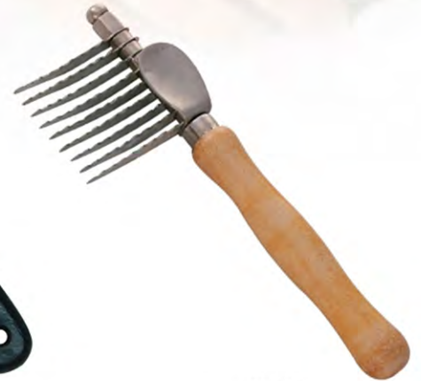
V-696 GROOMING EQUIPMENTS