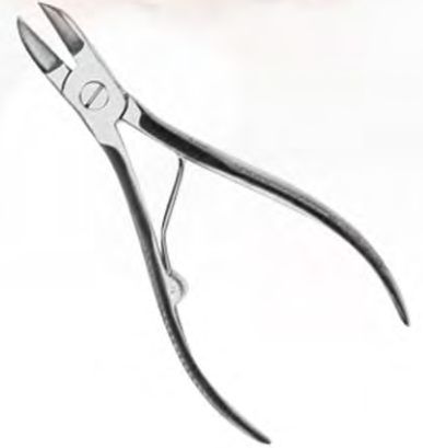
V-644 EQUINE DENTAL INSTRUMENTS