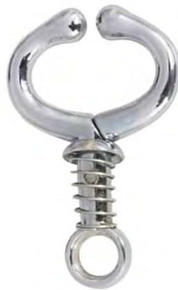
V-780 RESTRAINING INSTRUMENTS