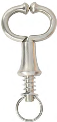
V-779 RESTRAINING INSTRUMENTS