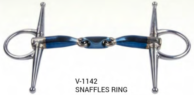
V-1142 SNAFFLES RING & BITS