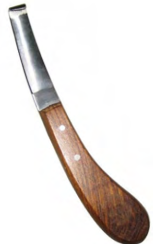
V-833 HOOF KNIVES