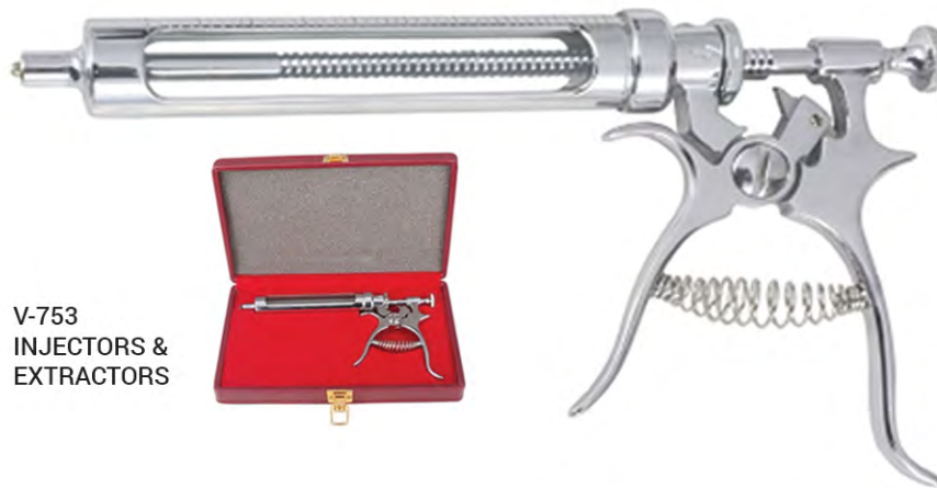
V-753 INJECTORS & EXTRACTORS