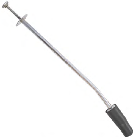
V-504 BALLING GUNS